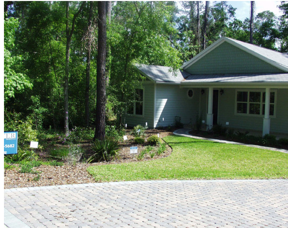
Landscape design for a resource efficient landscape in the Madera subdivision in Gainesville, FL. Photo illustrates the front yard portion of the installed landscape.